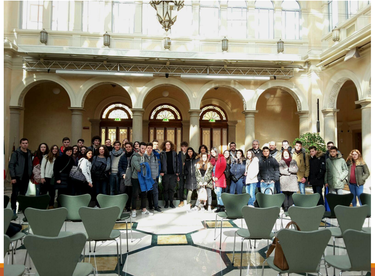
Then we went to visit the City hall and the Chamber of Commerce.